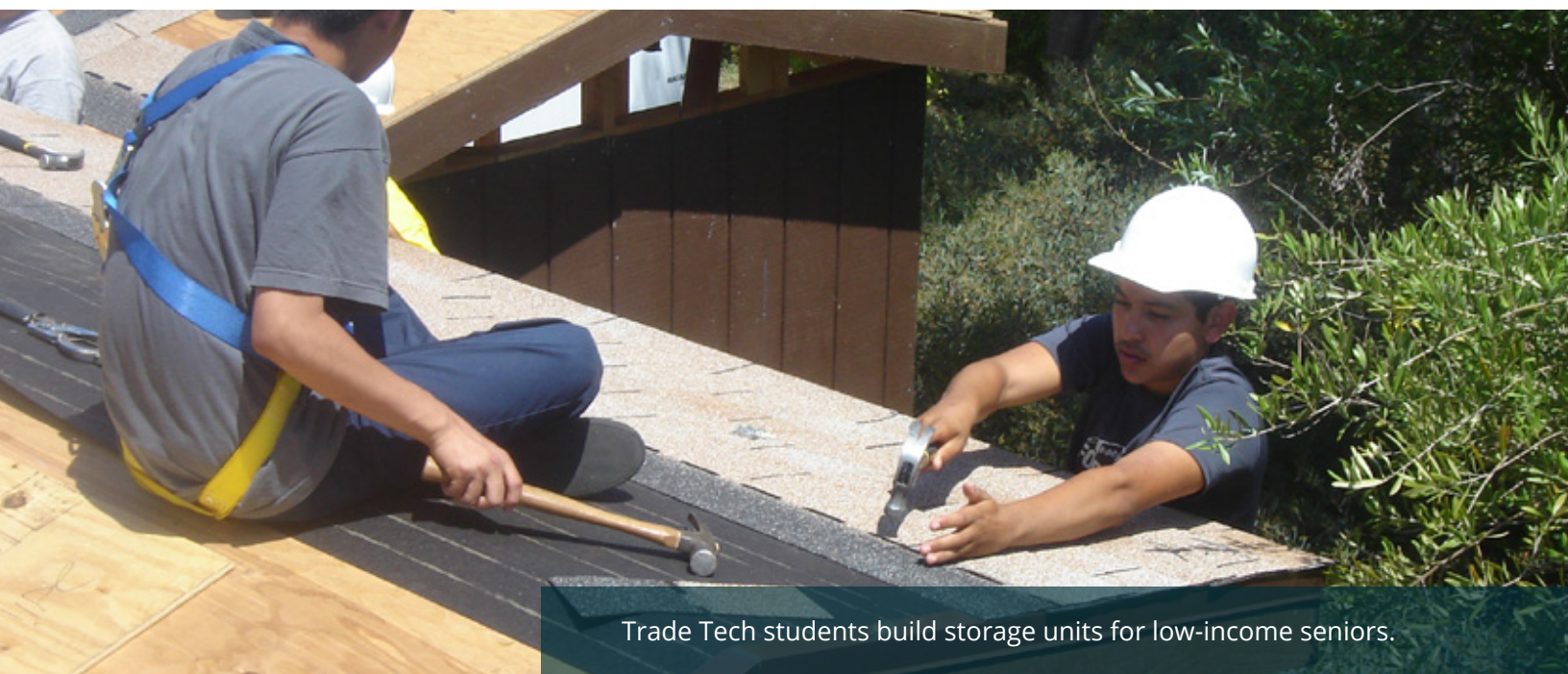
Trade Tech students build storage units for low-income seniors.