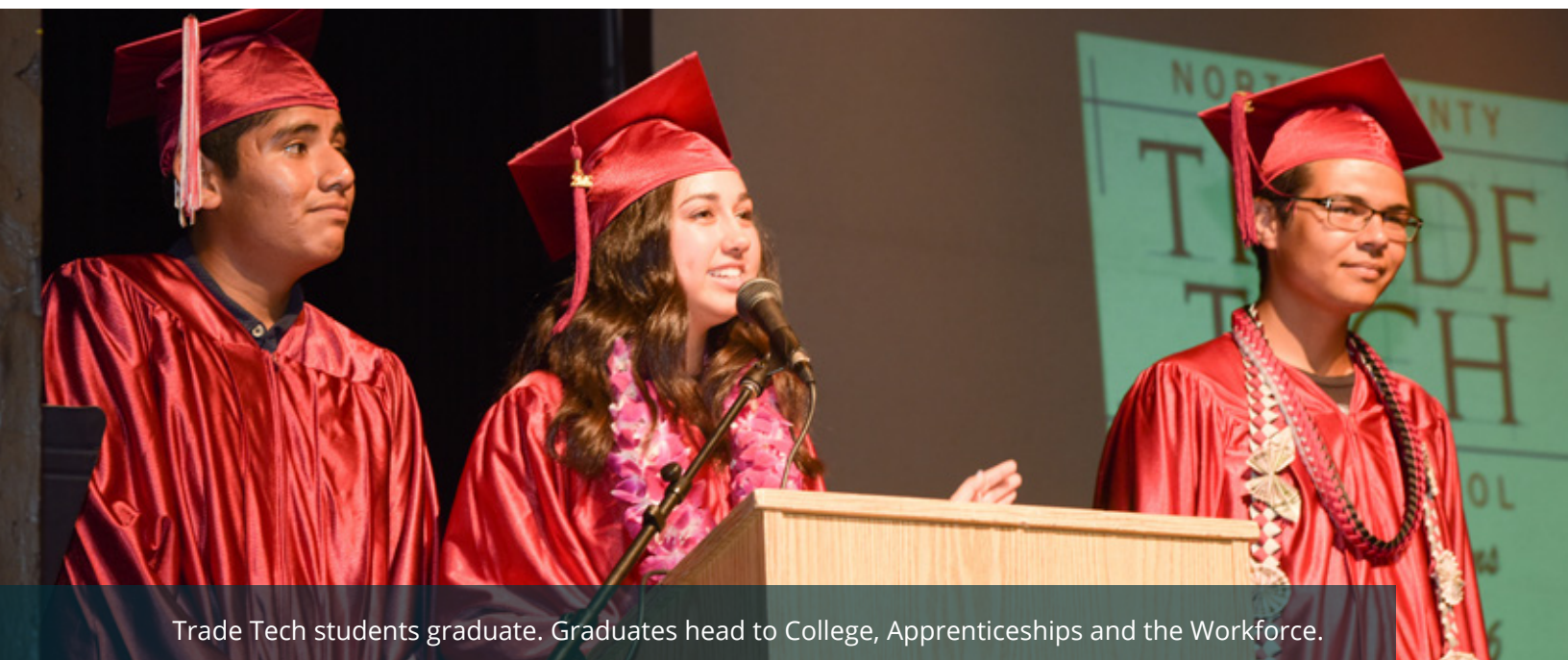
Trade Tech students graduate. Graduates head to College, Apprenticeships and the Workforce.