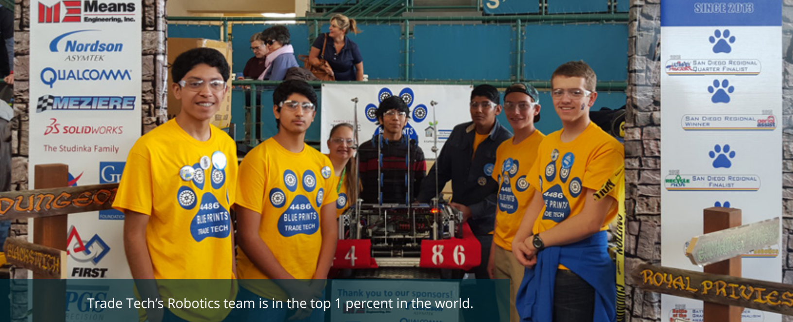
Trade Tech's Robotics team is in the top 1 percent in the world.