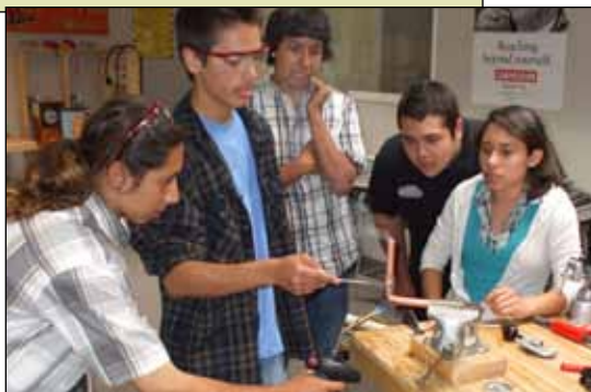
While learning the principles of plumbing, students also learn the principles of teamwork.

mathematics and history, lessons interweave project-based study in