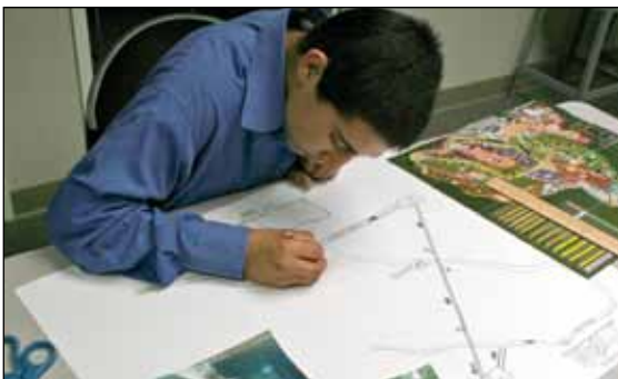
Trade Tech student perfects his drafting in Engineering

and colleges. No less significant is our curriculum. Leaning on the core subjects of science, English,